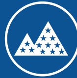
SUMMIT TO VALOR PROJECT