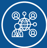
TACC Transition Assistance & Career Counseling