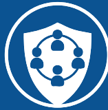
HONOR GUARDIAN Community Support