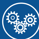
JOINT OPS Partnering with Non-Profits